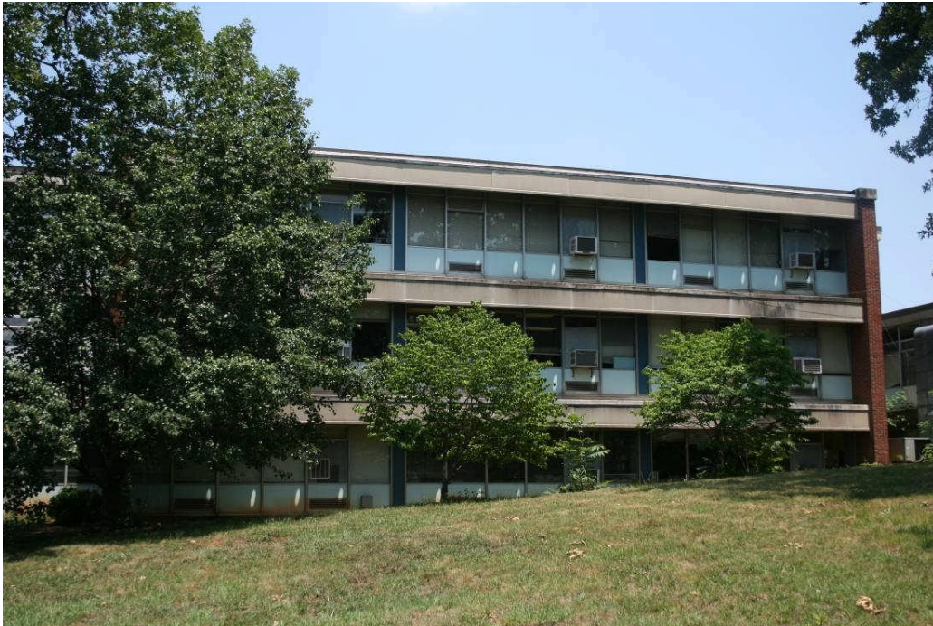
Claremont High School – 1959 Addition