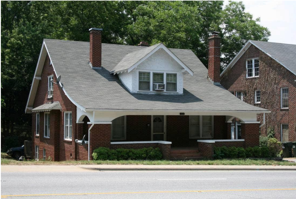
549 Second Street NE

Hickory, Catawba County, CT1069, Listed 12/18/2009 Nomination by Clay Griffith Photographs by Clay Griffith, June 2008