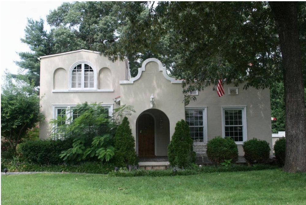
559 First Street NW