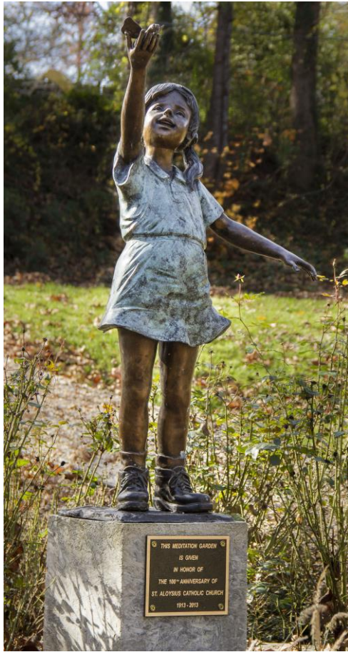
25. "Fly Away" by Randolph Rose. This bronze sculpture was donated in 2014 by Saint Aloysius Catholic Church commemorating its 100 th Anniversary. The sculpture is located in McComb Park.