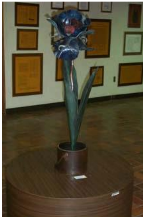
10. "Forever in Bloom" by Dean Curfman is a steel representational piece. It is located inside at City Hall. This sculpture was part of a temporary art exhibit at City Hall in 2005. PAC 2005.10