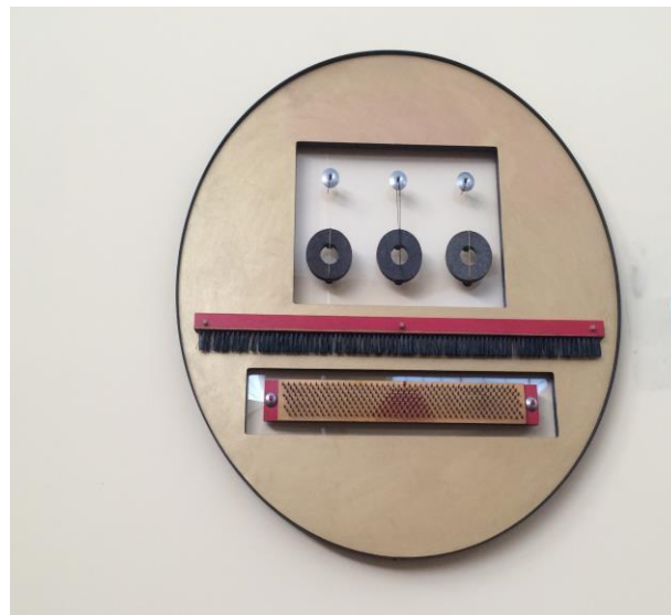
18. “The Art of Textiles” by Jan Craft is a contemporary wall sculpture made of composite materials highlighting the textile industry. The piece is located in the Patrick Beaver Memorial Library and was dedicated in 2014.