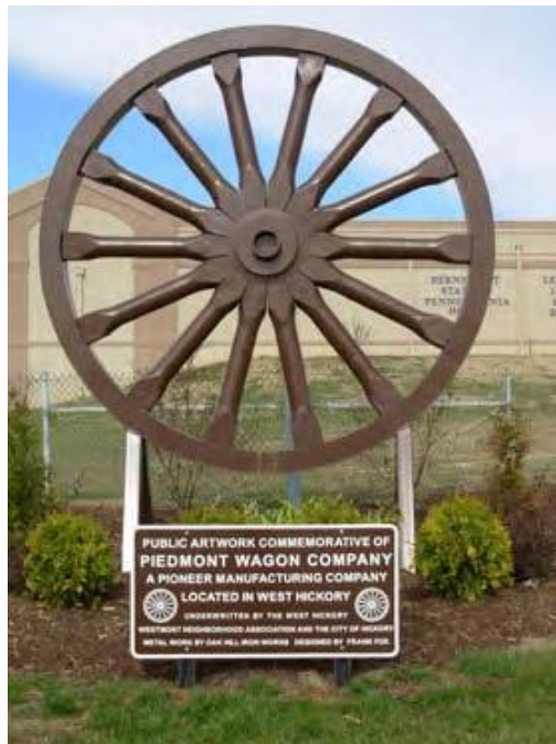
12. "Wheel of Time" by Dean Curfman is aluminum construction and was commissioned by the West Hickory/Westmont Neighborhood Association. It is located on Hwy 321 and 13 th Street SW. It was dedicated in 2006. PAC2006.12