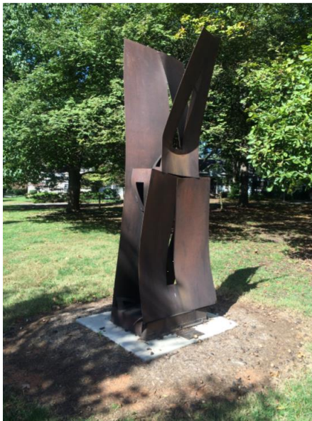
15. "Convergence" by Carl Billingsley is a steel sculpture. The piece is contemporary. It is located in Sally Fox Park and was dedicated in 2013