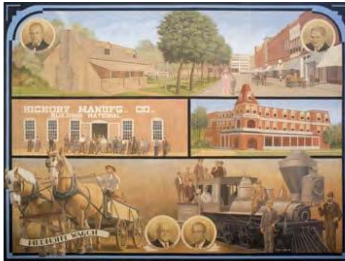
13. "Historic Mural" by Roger Cooke is a 25' by 35' wall mural painted on Union Square during the month of September 2006. PAC 2006.13