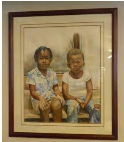
4. "Boy and Girl" by Ivey Hayes is a watercolor. It was purchased in 2001 and hangs in the Ridgeview Library. PAC 2001.4