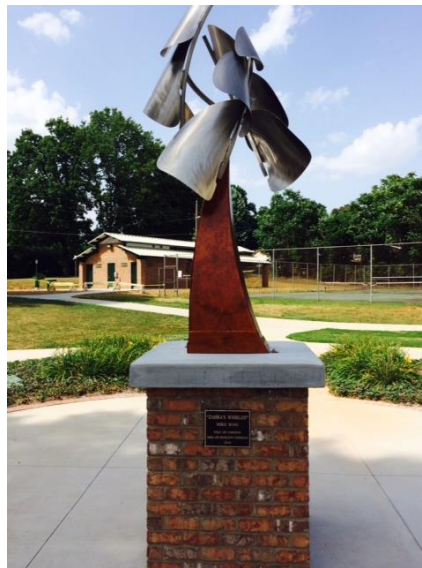
16. "Zahra's Whirled" by Mike Roig. The piece is a contemporary aluminum moving sculpture honoring the memory of Zahra Baker. It was dedicated in 2014 and is located at Kiwanis Park.