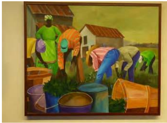
3. "Pulling Sweet Potato Plants" by Ivey Hayes is an acrylic painting. It was purchased in 2001 and hangs in the Ridgeview Library. PAC 2001.3