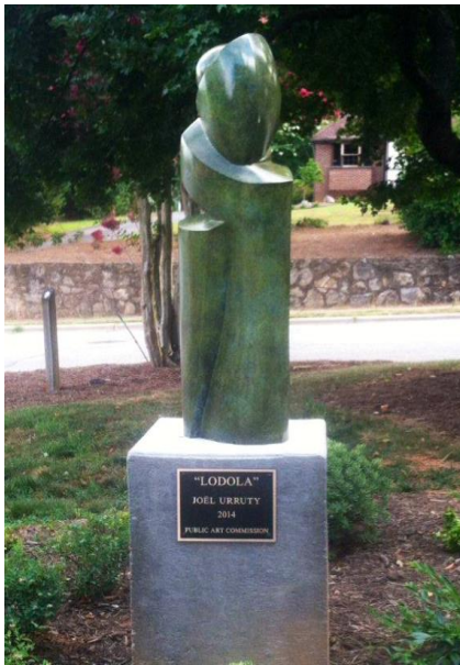
17. “Lodola” by Joel Urruty is a bronze sculpture with petura. It was dedicated in 2014 and is located in Sally Fox Park.